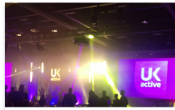
Wednesday 28th June - UK Active Flame Awards