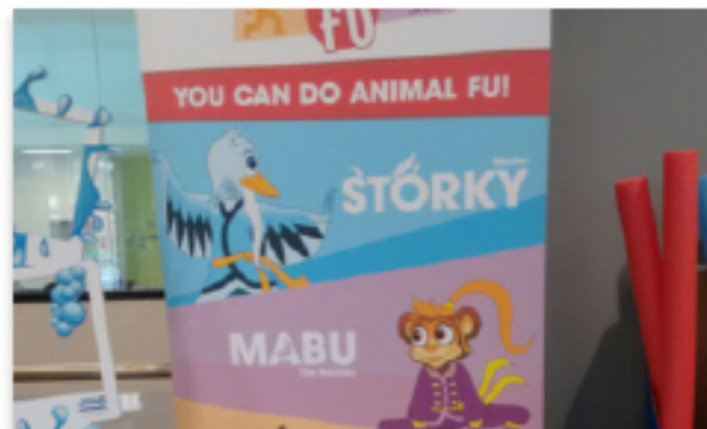
Saturday 3rd June - Everyone Active Action Centre, West London