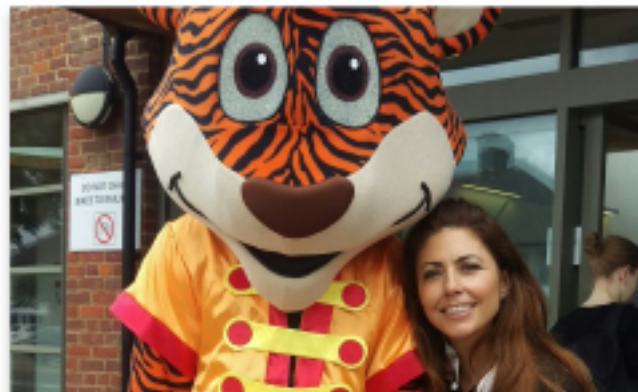
Saturday 24th June - Fusion Lifestyle Isleworth Centre, West London

Boris the Tiger and Miss Fu attended the launch of Animal Fu at the Isleworth centre of Fusion Lifestyle. Classes have started, running on Wednesday afternoons, from 4-4.30pm for 3-5 year olds and 4.30 – 5:15pm for 5-7 year olds. The final lesson before the summer break is on Wednesday 19th July 2017.